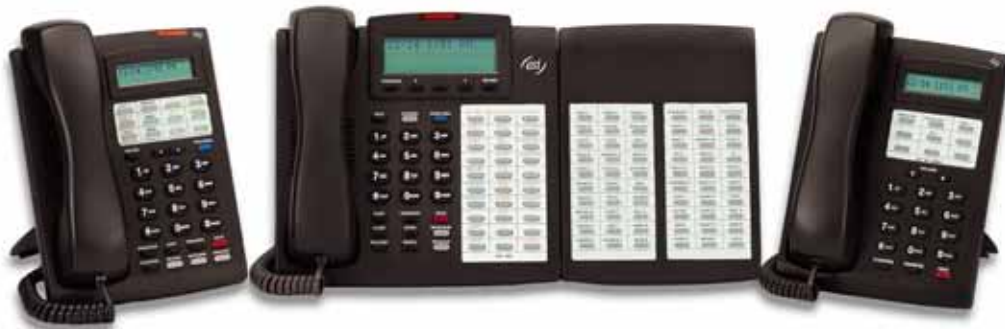
ESI desktop phone models, left to right: 24-Key Digital Feature Phone, 48-Key Digital Feature Phone with optional 60-Key Expansion Console, 12-Key Digital Feature Phone.

IVX S-Class lets you forward an outside call directly to a cellular phone, branch office, or answering service.